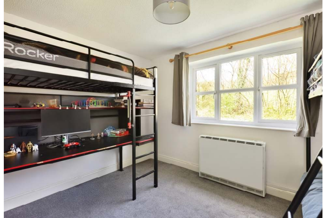
Two comfortable double bedrooms and supporting bathroom